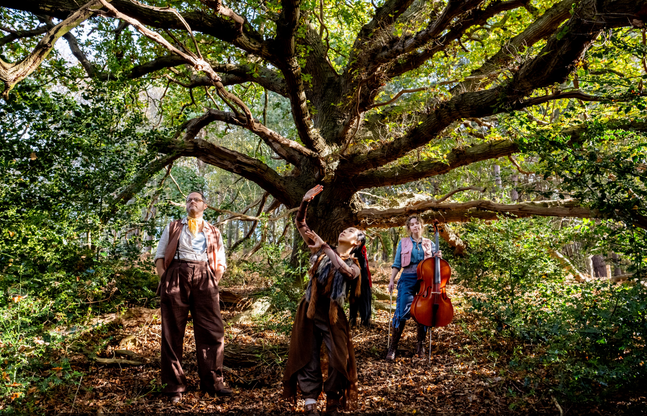
The Ancient Oak of Baldor—Visual Story